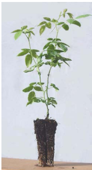
Dog rose - Rosa canina

Castleden Trees cannot accept any liability after plants have been accepted at collection/delivery.